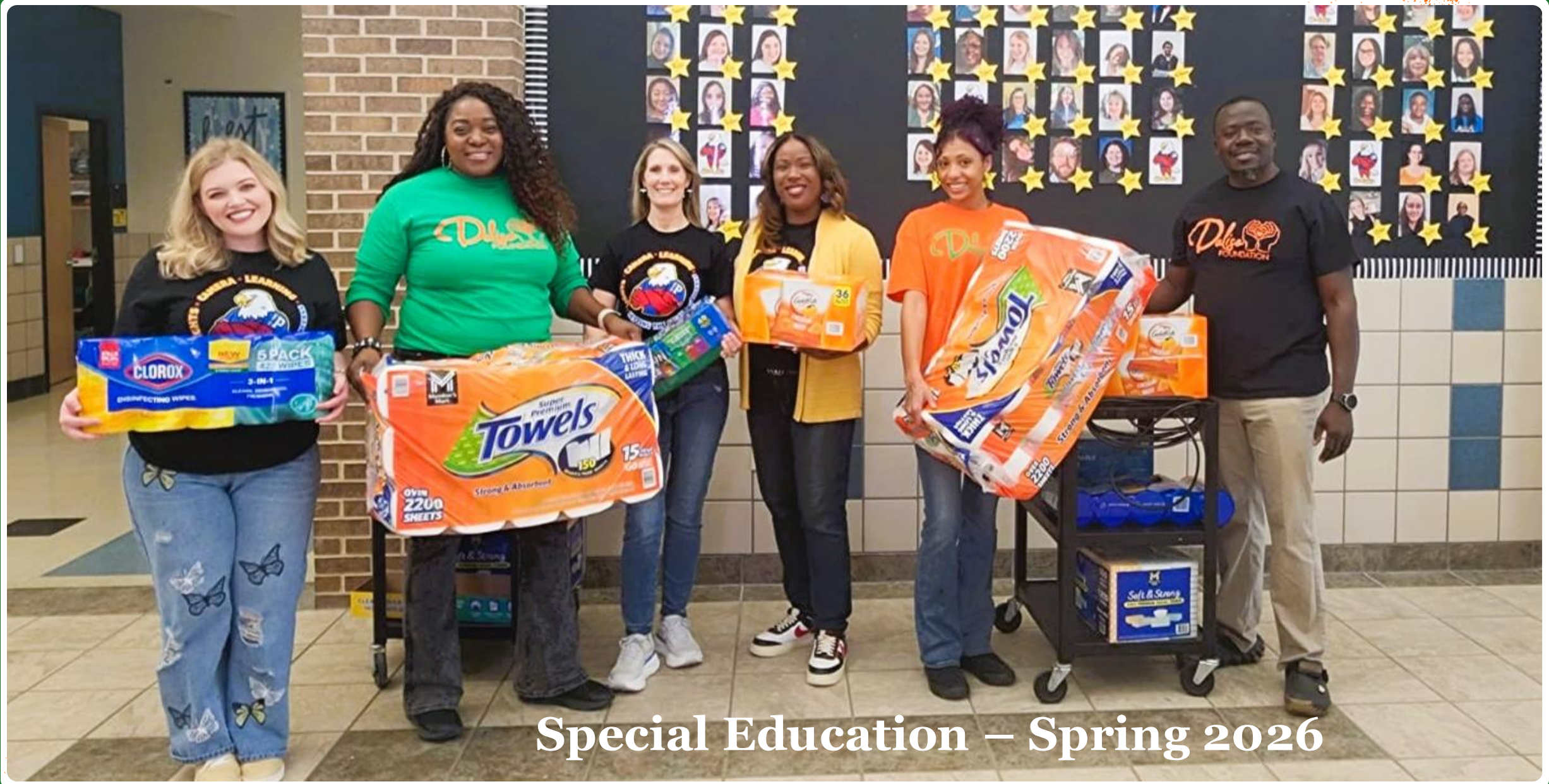
Special Education – Spring 2026